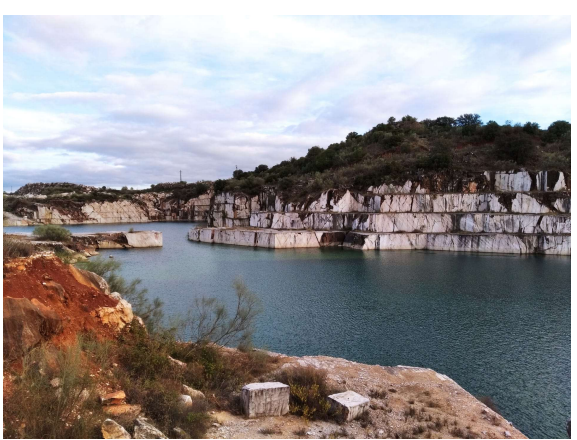
Fig. 3. Abandoned quarries.

properly protected spaces, polluting surrounding agricultural land and contaminating water lines because don't have required treatment. In addition, it must be decided what to do with the hundreds of large and deepness abandoned quarries, in order to prevent new accidents. In the 2018 the National Road 255 between Borba and Vila Viçosa collapsed resulting in five deaths8. Until few months there was constraints and dangers for the circulation on other roads, as was the case of Vila Viçosa-Alandroal and the entrance in city of Estremoz9. And the situation of Vila Viçosa — Bencatel remains with various problems in different sections of that road. [Quintas:2022]